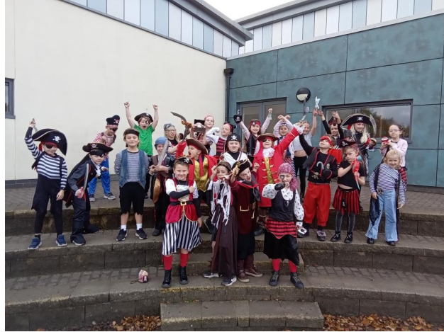
5 - There were some incredible outfits on pirate day!