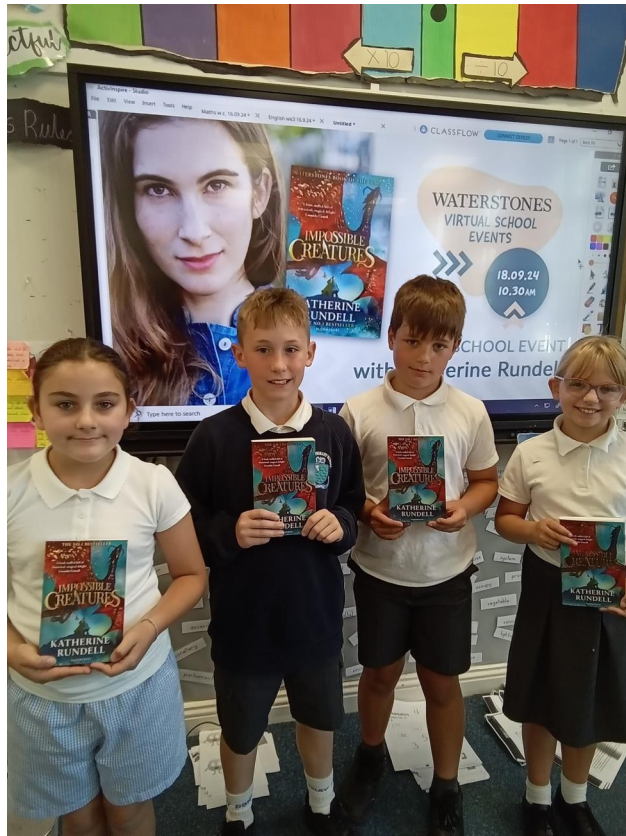
10 - Katherine Rundell

We have been focusing on this text in our English lessons, and the children have thoroughly enjoyed reading and exploring the book. During the workshop, Katherine shared some fantastic tips, including how she generates ideas for her stories and the importance of knowing how a story will end. The session was incredibly engaging, and the children were inspired to apply Katherine's advice to their own mystery and suspense writing. It was a truly memorable experience for everyone involved!