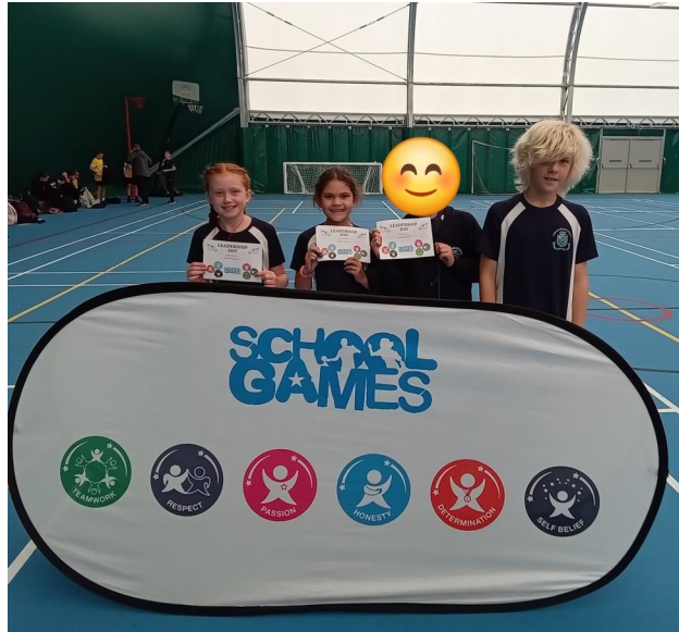
11 - School Games Leaders

We are delighted to announce that we have achieved the School Games Gold Mark Award for the 2023/24 academic year.