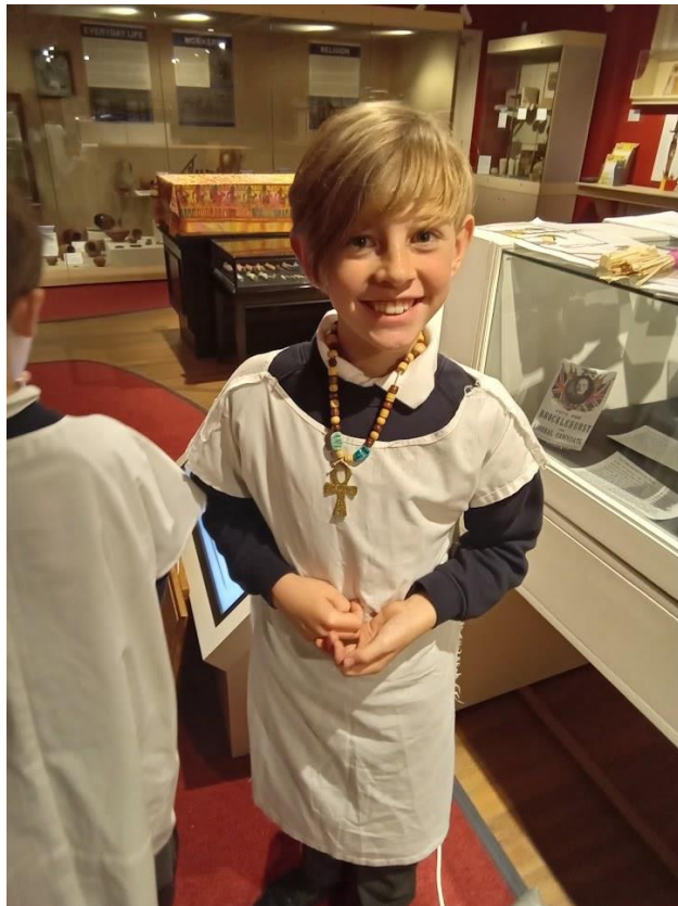
7 - The children enjoyed being able to get hands on with artefacts.