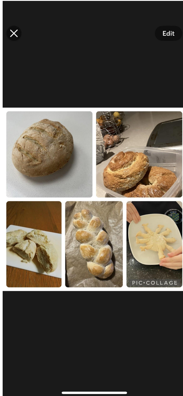
9 - Bread making in DT. Here are some of the incredible end products.

What an incredible start to our Year 5 journey, well done everyone!