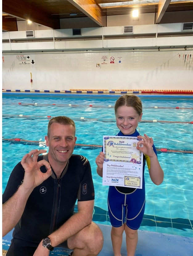
14 - Poppy has recently completed her 'Bubble Makers' course with Scuba Cheshire.