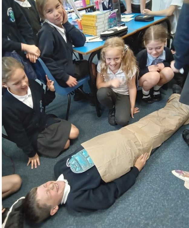
8 - We created a mummy! Using our focus text 'Mummies Unwrapped' we followed the ancient steps of the process to create our very own mummy! *No children were harmed in the making of this lesson.*