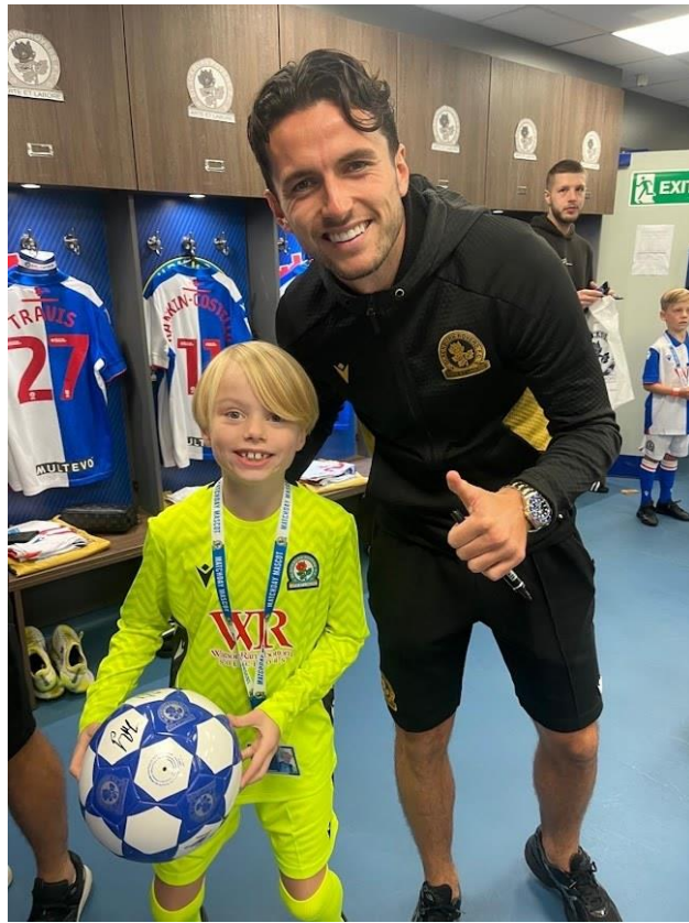
13 - Oscar S was a mascot for Blackburn FC