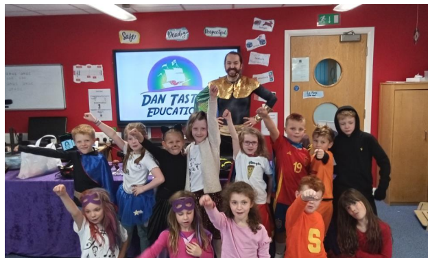
2 - Year 2 superhero workshop run by Dan Tastic Education