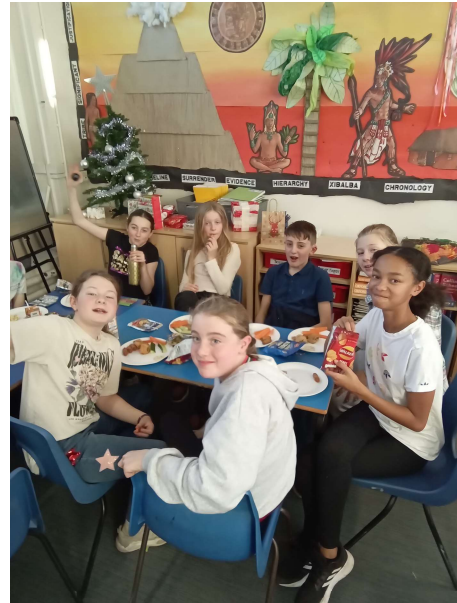
Enjoying the festivities in Y6!