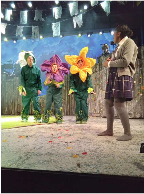
Y5 and 6 went to see The Snow Queen in Chester. They thoroughly enjoyed the show!